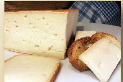
CABRA LA MANCHA