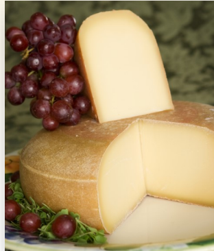
PLEASANT RIDGE RESERVE