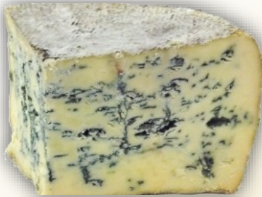
BLACK & BLUE